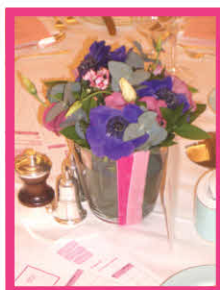
A variety of beautiful arrangements were on all the tables